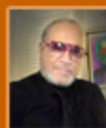
PUBLISHER DANNY RAMOS