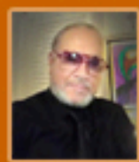
PUBLISHER DANNY RAMOS